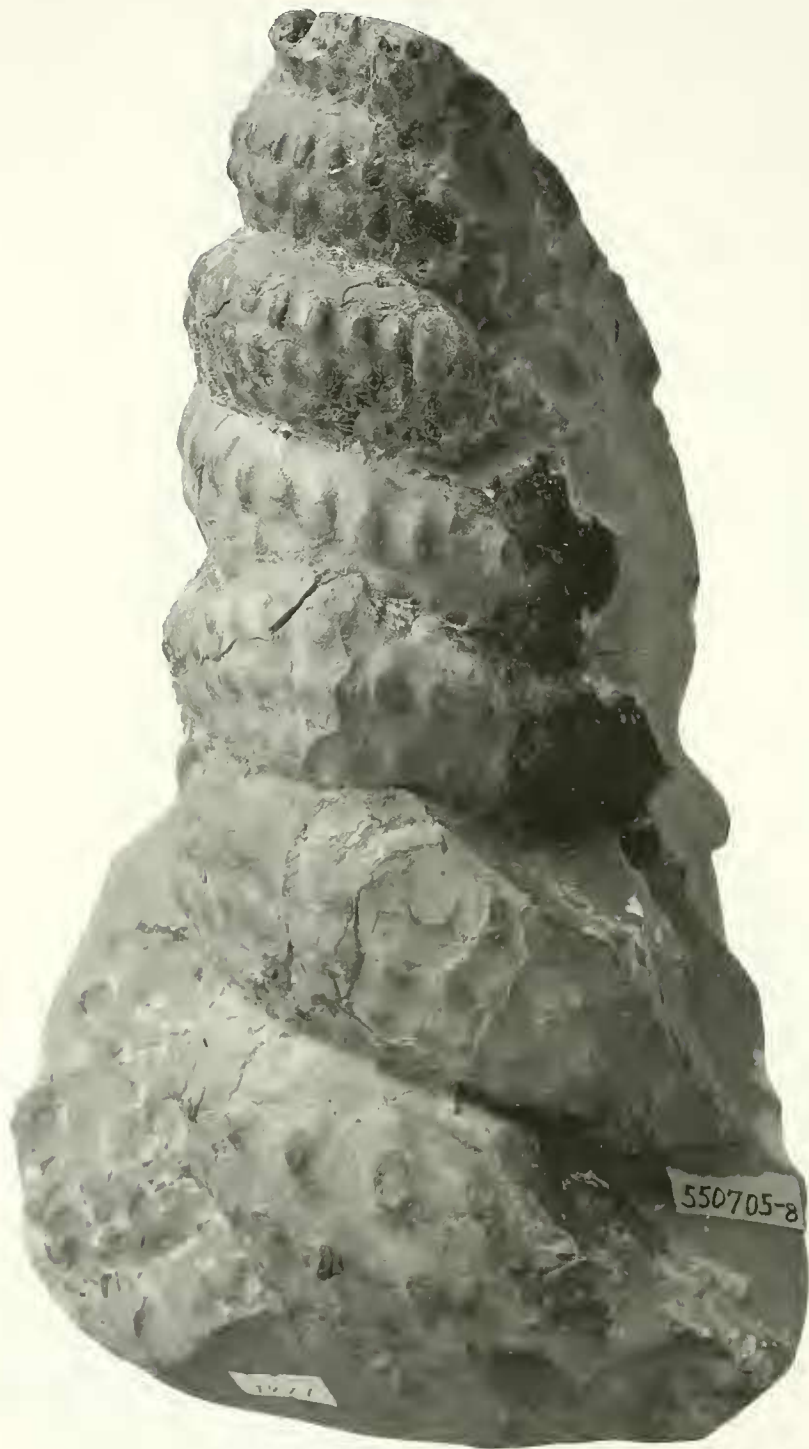
Figure 3. Mariella (Mariella) lewesiensis (Spath). NSM PM16123. Specimen turned about 60° clockwise from the position in Figure 2, \times 2/3 . (Photo courtesy of Katsumi Shinohara, without whitening)